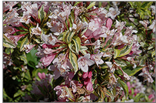
Rainbow Sensation Weigela flowers

Rainbow Sensation Weigela is recommended for the following landscape applications;