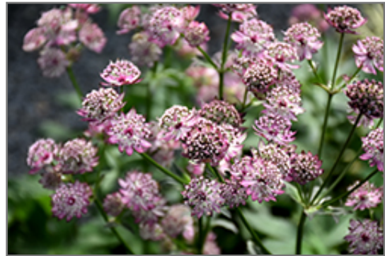
Abbey Road Masterwort flowers