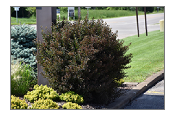
Little Devil Ninebark

Little Devil Ninebark is recommended for the following landscape applications;