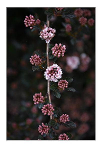
Little Devil Ninebark flowers