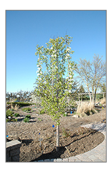
Summercrisp Pear in bloom