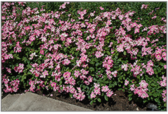
Nearly Wild Rose in bloom