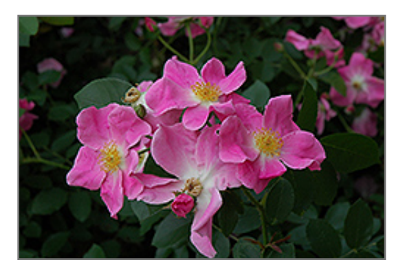
Nearly Wild Rose flowers

Nearly Wild Rose is recommended for the following landscape applications;