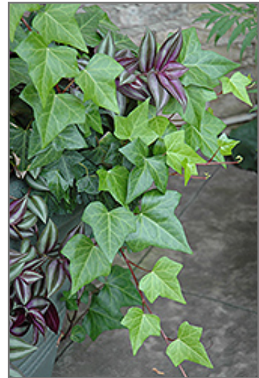
Algerian Ivy foliage