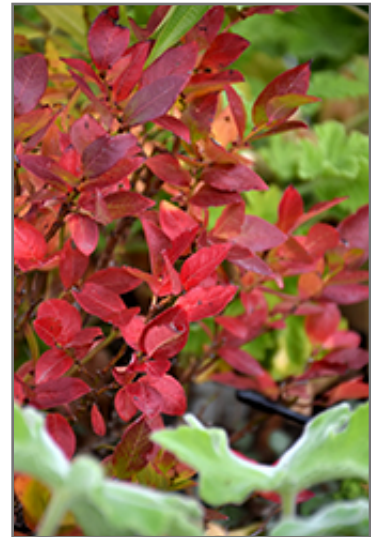
Jelly Bean Blueberry in fall

Jelly Bean Blueberry features dainty clusters of white bell-shaped flowers with shell pink overtones hanging below the branches in mid spring. It has red-variegated green foliage. The glossy oval leaves turn an outstanding red in the fall. It features an abundance of magnificent blue berries in mid summer.