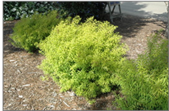
Mellow Yellow Spirea

Mellow Yellow Spirea is recommended for the following landscape applications;