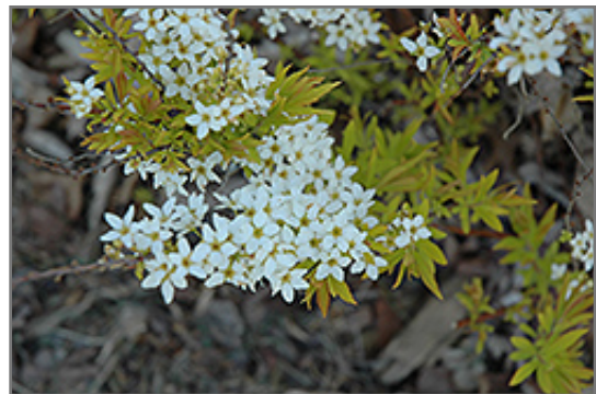
Mellow Yellow Spirea flowers