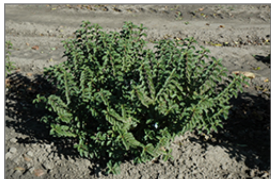
Pucker Up Red Twig Dogwood