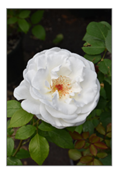
Sugar Moon Rose flowers