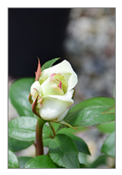
Sugar Moon Rose flower buds

This shrub should only be grown in full sunlight. It does best in average to evenly moist conditions, but will not tolerate standing water. It is not particular as to soil type or pH. It is somewhat tolerant of urban pollution. This particular variety is an interspecific hybrid.