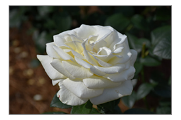
Sugar Moon Rose flowers

Sugar Moon Rose is recommended for the following landscape applications;