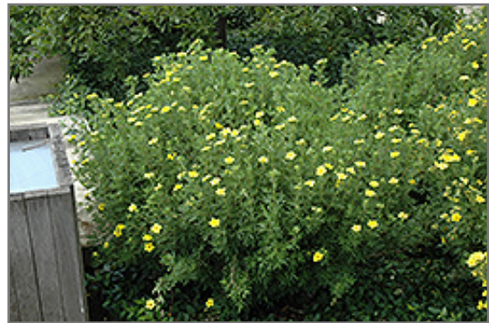
Fredheim Potentilla in bloom