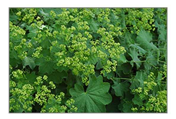
Lady's Mantle flowers

Lady's Mantle is recommended for the following landscape applications;