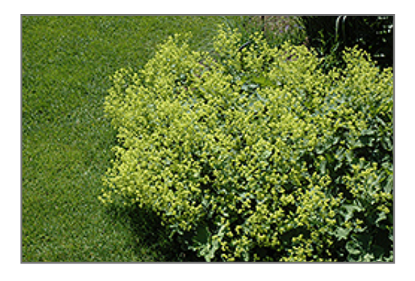
Lady's Mantle in bloom