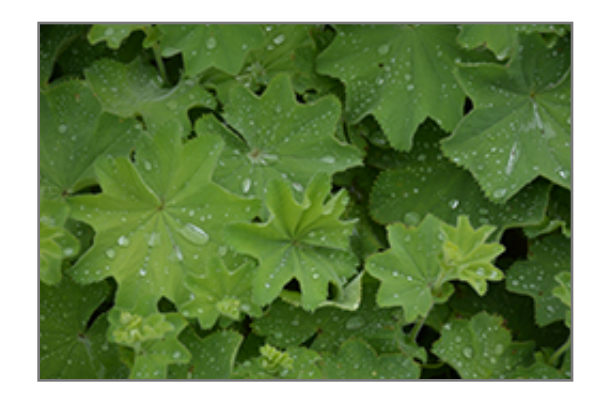
Lady's Mantle foliage

Lady's Mantle will grow to be about 18 inches tall at maturity, with a spread of 18 inches. Its foliage tends to remain dense right to the ground, not requiring facer plants in front. It grows at a medium rate, and under ideal conditions can be expected to live for approximately 10 years. As an herbaceous perennial, this plant will usually die back to the crown each winter, and will regrow from the base each spring. Be careful not to disturb the crown in late winter when it may not be readily seen!