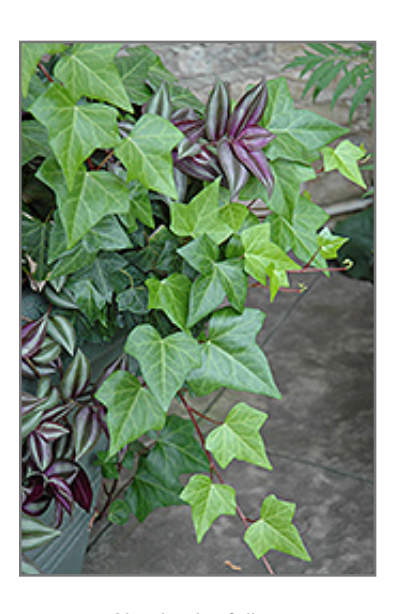
Algerian Ivy foliage

When grown indoors, Algerian Ivy can be expected to grow to be about 10 feet tall at maturity, with a spread of 3 feet. It grows at a fast rate, and under ideal conditions can be expected to live for approximately 30 years. This houseplant performs well in both bright or indirect sunlight and strong artificial light, and can therefore be situated in almost any well-lit room or location. It is very adaptable to both dry and moist soil, and should do just fine under average home conditions. The surface of the soil shouldn't be allowed to dry out completely, and so you should expect to water this plant once and possibly even twice each week. Be aware that your particular watering schedule may vary depending on its location in the room, the pot size, plant size and other conditions; if in doubt, ask one of our experts in the store for advice. It is not particular as to soil pH, but grows best in rich soil. Contact the store for specific recommendations on pre-mixed potting soil for this plant. Be warned that parts of this plant are known to be toxic to humans and animals, so special care should be exercised if growing it around children and pets.