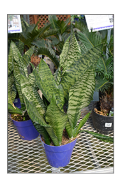
Futura Robusta Snake Plant

When grown indoors, Futura Robusta Snake Plant can be expected to grow to be about 24 inches tall at maturity, with a spread of 12 inches. It grows at a slow rate, and under ideal conditions can be expected to live for approximately 10 years. This houseplant performs well in both bright or indirect sunlight and strong artificial light, and can therefore be situated in almost any well-lit room or location. It is very adaptable to both dry and moist soil, and should do just fine under average home conditions. The surface of the soil shouldn't be allowed to dry out completely, and so you should expect to water this plant once and possibly even twice each week. Be aware that your particular watering schedule may vary depending on its location in the room, the pot size, plant size and other conditions; if in doubt, ask one of our experts in the store for advice. It is not particular as to soil pH, but grows best in sandy soil. Contact the store for specific recommendations on pre-mixed potting soil for this plant.