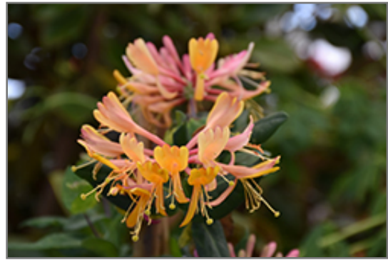
Goldflame Honeysuckle flowers