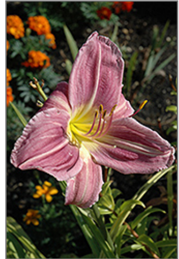
Prairie Blue Eyes Daylily flowers