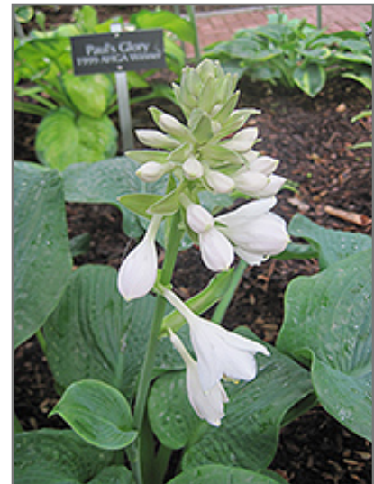
Elegans Hosta flowers