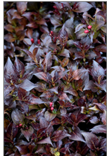
Coco Krunch Weigela foliage