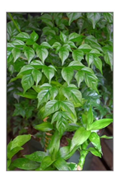
China Doll foliage

When grown indoors, China Doll can be expected to grow to be about 6 feet tall at maturity, with a spread of 4 feet. It grows at a medium rate, and under ideal conditions can be expected to live for approximately 40 years. This houseplant will do well in a location that gets either direct or indirect sunlight, although it will usually require a more brightly-lit environment than what artificial indoor lighting alone can provide. It does best in average to evenly moist soil, but will not tolerate standing water. The surface of the soil shouldn't be allowed to dry out completely, and so you should expect to water this plant once and possibly even twice each week. Be aware that your particular watering schedule may vary depending on its location in the room, the pot size, plant size and other conditions; if in doubt, ask one of our experts in the store for advice. It is not particular as to soil type or pH; an average potting soil should work just fine.