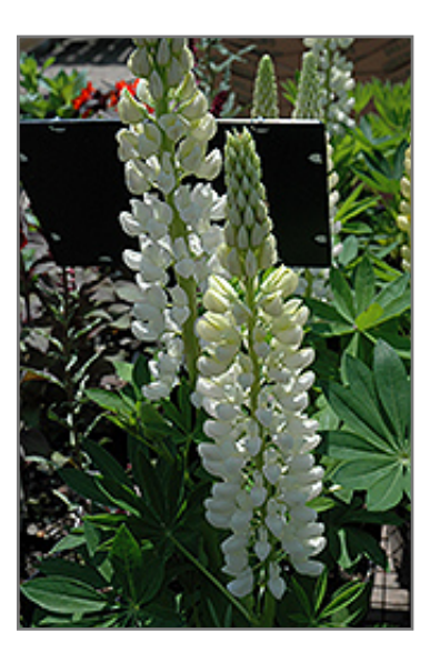
Russell White Lupine flowers

Russell White Lupine features bold spikes of white pea-like flowers rising above the foliage from late spring to early summer. The flowers are excellent for cutting. Its palmate leaves remain emerald green in color throughout the season.