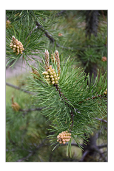
Lodgepole Pine foliage