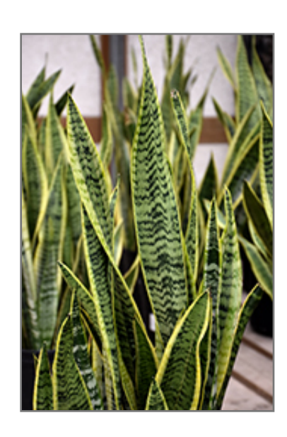
Futura Superba Snake Plant foliage

When grown indoors, Futura Superba Snake Plant can be expected to grow to be about 18 inches tall at maturity, with a spread of 12 inches. It grows at a slow rate, and under ideal conditions can be expected to live for approximately 10 years. This houseplant performs well in both bright or indirect sunlight and strong artificial light, and can therefore be situated in almost any well-lit room or location. It is very adaptable to both dry and moist soil, and should do just fine under average home conditions. The surface of the soil shouldn't be allowed to dry out completely, and so you should expect to water this plant once and possibly even twice each week. Be aware that your particular watering schedule may vary depending on its location in the room, the pot size, plant size and other conditions; if in doubt, ask one of our experts in the store for advice. It is not particular as to soil pH, but grows best in sandy soil. Contact the store for specific recommendations on pre-mixed potting soil for this plant. Be warned that parts of this plant are known to be toxic to humans and animals, so special care should be exercised if growing it around children and pets.