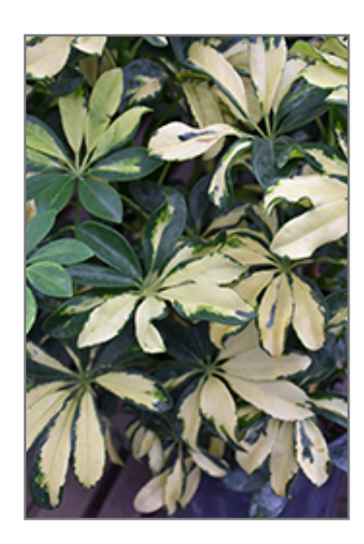
Variegated Dwarf Schefflera foliage

When grown indoors, Variegated Dwarf Schefflera can be expected to grow to be about 5 feet tall at maturity, with a spread of 3 feet. It grows at a medium rate, and under ideal conditions can be expected to live for approximately 10 years. This houseplant performs well in both bright or indirect sunlight and strong artificial light, and can therefore be situated in almost any well-lit room or location. It prefers to grow in average to moist soil. The surface of the soil shouldn't be allowed to dry out completely, and so you should expect to water this plant once and possibly even twice each week. Be aware that your particular watering schedule may vary depending on its location in the room, the pot size, plant size and other conditions; if in doubt, ask one of our experts in the store for advice. It is not particular as to soil type or pH; an average potting soil should work just fine. Be warned that parts of this plant are known to be toxic to humans and animals, so special care should be exercised if growing it around children and pets.