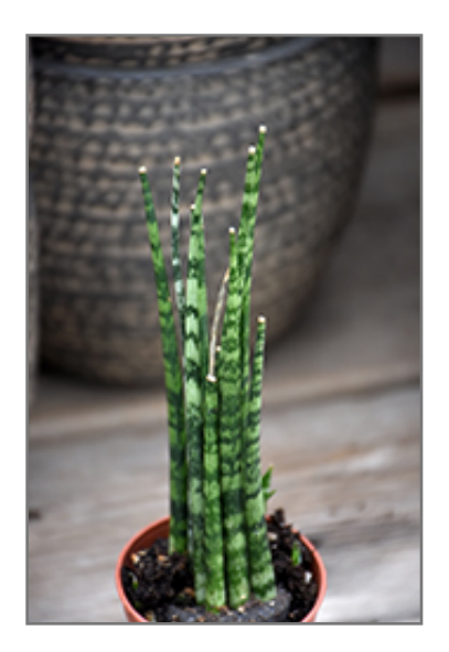
Mikado Cylindrical Snake Plant

When grown indoors, Mikado Cylindrical Snake Plant can be expected to grow to be about 3 feet tall at maturity, with a spread of 18 inches. It grows at a slow rate, and under ideal conditions can be expected to live for approximately 10 years. This houseplant will do well in a location that gets either direct or indirect sunlight, although it will usually require a more brightly-lit environment than what artificial indoor lighting alone can provide. It prefers dry to average moisture levels with very well-drained soil, and may die if left in standing water for any length of time. This plant should be watered when the surface of the soil gets dry, and will need watering approximately once each week. Be aware that your particular watering schedule may vary depending on its location in the room, the pot size, plant size and other conditions; if in doubt, ask one of our experts in the store for advice. It is not particular as to soil pH, but grows best in sandy soil. Contact the store for specific recommendations on pre-mixed potting soil for this plant. Be warned that parts of this plant are known to be toxic to humans and animals, so special care should be exercised if growing it around children and pets.