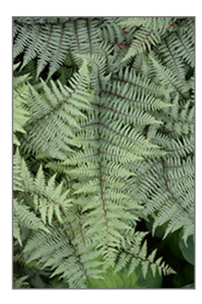
Ghost Fern foliage