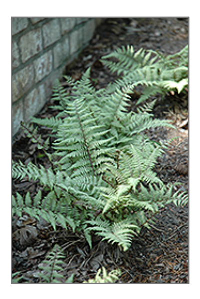
Ghost Fern