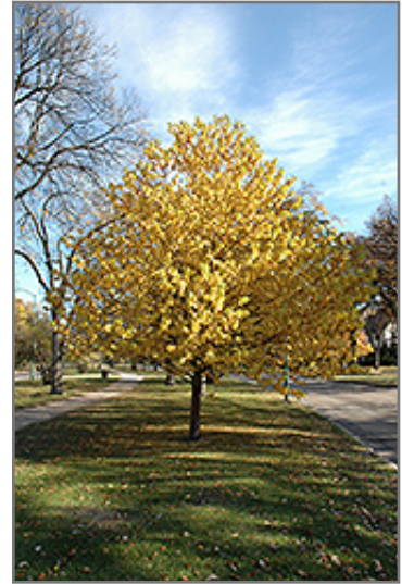
Amur Cherry in fall

This tree should only be grown in full sunlight. It does best in average to evenly moist conditions, but will not tolerate standing water. It is not particular as to soil type or pH. It is somewhat tolerant of urban pollution. This species is not originally from North America.