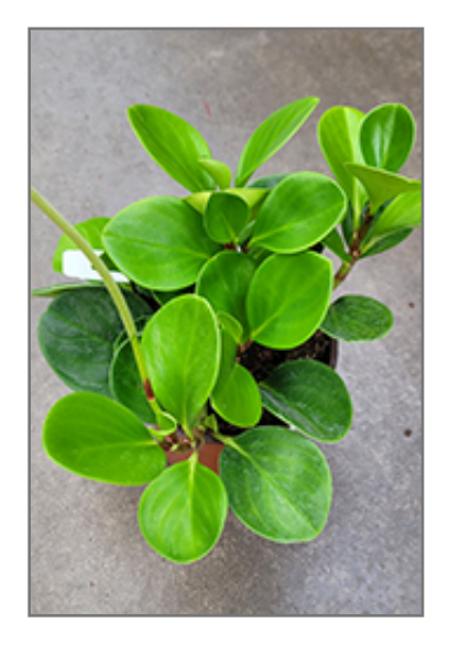
Baby Rubber Plant foliage

When grown indoors, Baby Rubber Plant can be expected to grow to be about 12 inches tall at maturity, with a spread of 12 inches. It grows at a medium rate, and under ideal conditions can be expected to live for approximately 5 years. This houseplant performs well in both bright or indirect sunlight and strong artificial light, and can therefore be situated in almost any well-lit room or location. It prefers to grow in average to moist soil. The surface of the soil shouldn't be allowed to dry out completely, and so you should expect to water this plant once and possibly even twice each week. Be aware that your particular watering schedule may vary depending on its location in the room, the pot size, plant size and other conditions; if in doubt, ask one of our experts in the store for advice. It will benefit from a regular feeding with a general-purpose fertilizer with every second or third watering. It is not particular as to soil pH, but grows best in rich soil. Contact the store for specific recommendations on pre-mixed potting soil for this plant.