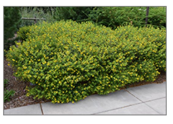
Ames St. John's Wort in bloom

Ames St. John's Wort is smothered in stunning gold flowers along the branches in mid summer. The flowers are excellent for cutting. It has bluish-green deciduous foliage. The narrow leaves do not develop any appreciable fall color.