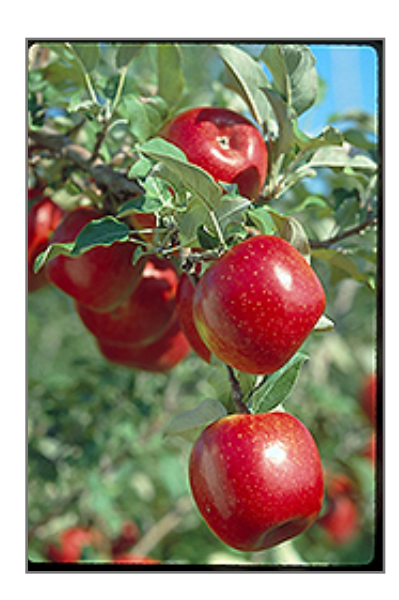
Prairie Spy Apple fruit

This is a deciduous tree with a more or less rounded form. Its average texture blends into the landscape, but can be balanced by one or two finer or coarser trees or shrubs for an effective composition. This is a high maintenance plant that will require regular care and upkeep, and is best pruned in late winter once the threat of extreme cold has passed. Gardeners should be aware of the following characteristic(s) that may warrant special consideration;