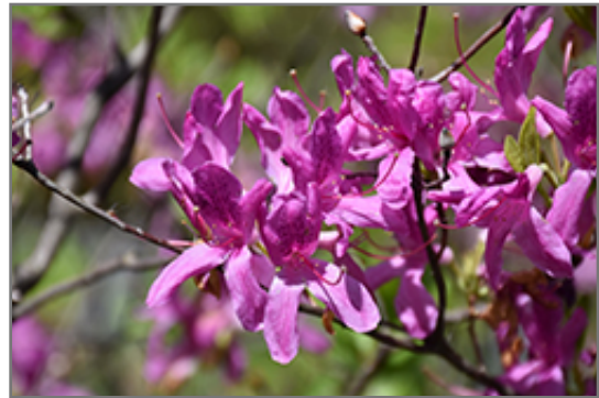
Lilac Lights Azalea flowers