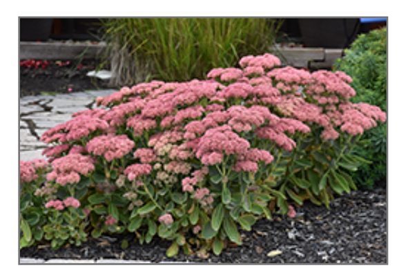
Autumn Fire Stonecrop in bloom

Autumn Fire Stonecrop is recommended for the following landscape applications;