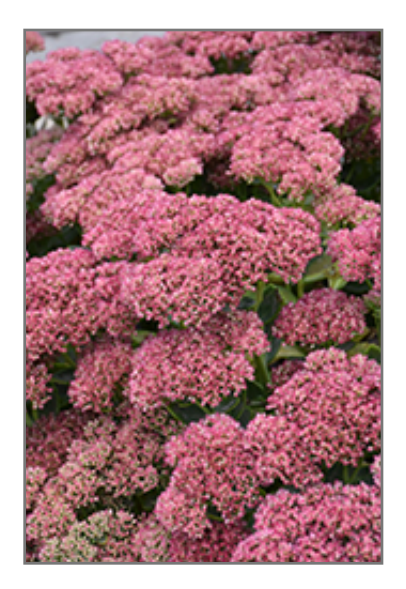
Autumn Fire Stonecrop flowers