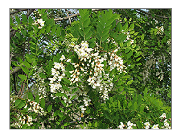
Black Locust flowers