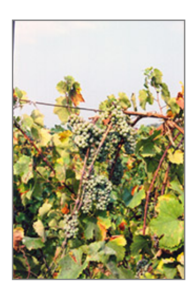
Riesling Grape fruit

Aside from its primary use as an edible, Riesling Grape is sutiable for the following landscape applications;