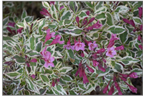
My Monet Weigela flowers

My Monet Weigela is recommended for the following landscape applications;