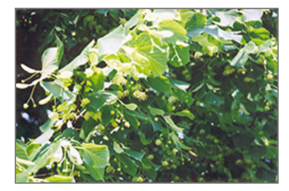
Littleleaf Linden flowers