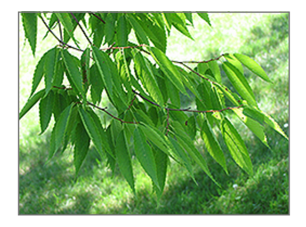
Japanese Zelkova foliage