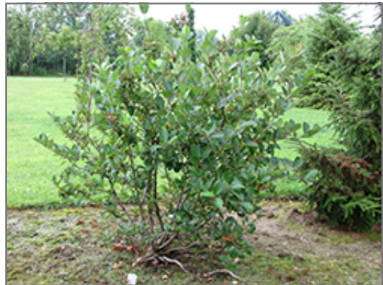
Viking Chokeberry