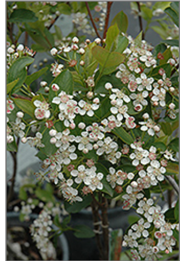
Viking Chokeberry flowers

Viking Chokeberry is recommended for the following landscape applications;