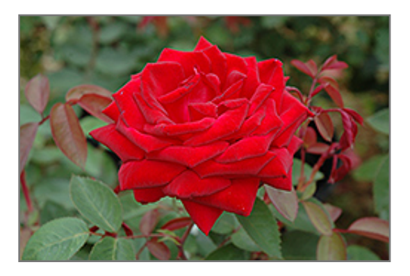
Kashmir Rose flowers

Kashmir Rose is recommended for the following landscape applications;