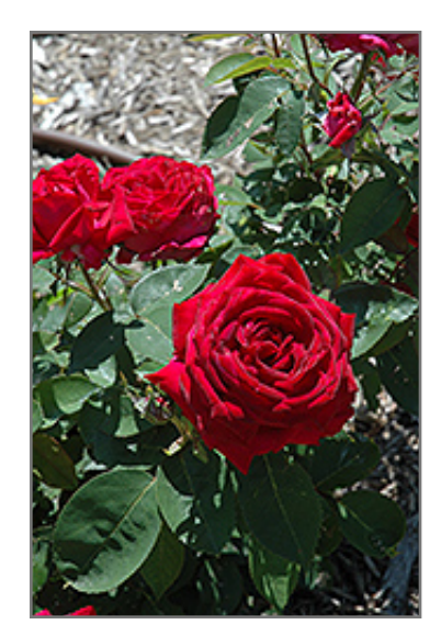
Kashmir Rose flowers