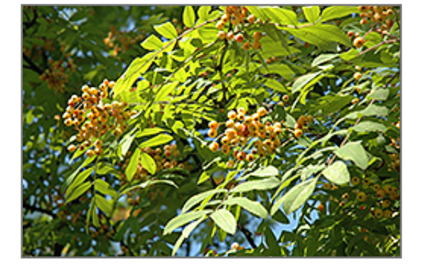
European Mountain Ash fruit

European Mountain Ash features showy clusters of white flowers held atop the branches in mid spring. The yellow fruits are held in abundance in spectacular clusters from early fall to late winter. It has dark green deciduous foliage. The oval compound leaves turn an outstanding orange in the fall. The smooth olive green bark adds an interesting dimension to the landscape.