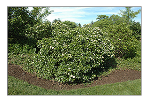
Raspberry Tart Viburnum in bloom

Raspberry Tart Viburnum will grow to be about 5 feet tall at maturity, with a spread of 5 feet. It has a low canopy, and is suitable for planting under power lines. It grows at a medium rate, and under ideal conditions can be expected to live for 40 years or more.