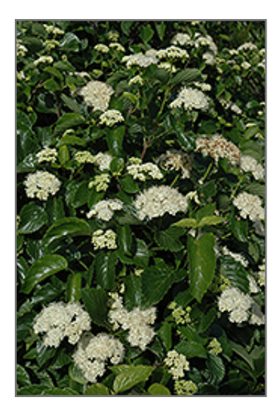
Raspberry Tart Viburnum flowers