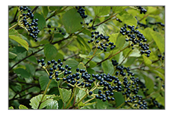
Raspberry Tart Viburnum fruit

This is a relatively low maintenance shrub, and should only be pruned after flowering to avoid removing any of the current season's flowers. It is a good choice for attracting birds to your yard, but is not particularly attractive to deer who tend to leave it alone in favor of tastier treats. It has no significant negative characteristics.