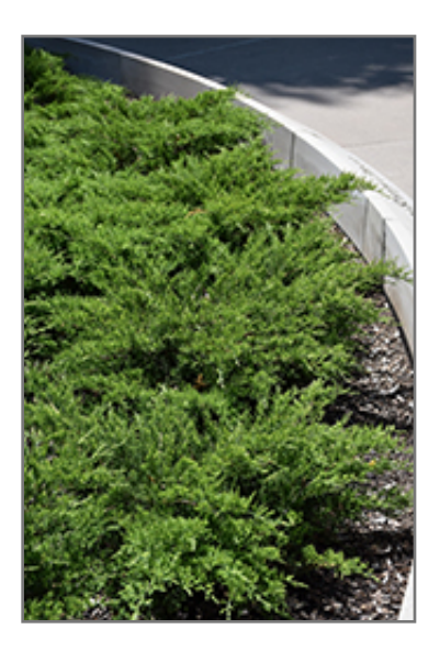
Broadmoor Juniper