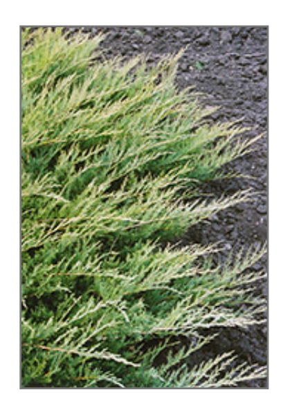
Broadmoor Juniper foliage