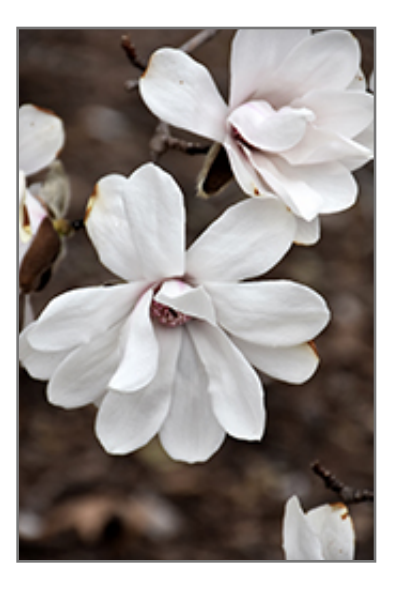
Merrill Magnolia flowers