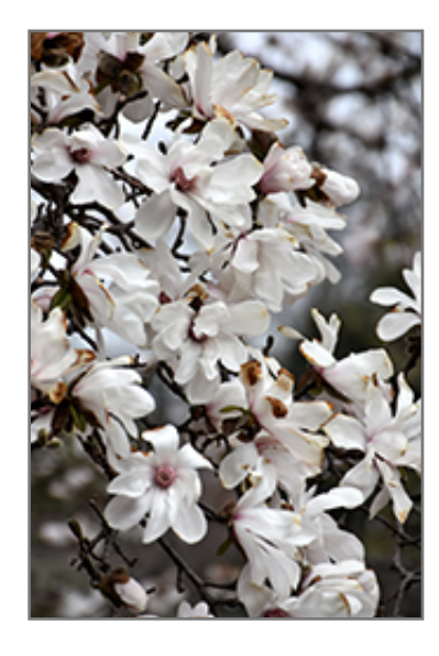
Merrill Magnolia flowers

This tree does best in full sun to partial shade. It requires an evenly moist well-drained soil for optimal growth, but will die in standing water. It is not particular as to soil type, but has a definite preference for acidic soils. It is quite intolerant of urban pollution, therefore inner city or urban streetside plantings are best avoided. Consider applying a thick mulch around the root zone in winter to protect it in exposed locations or colder microclimates. This particular variety is an interspecific hybrid.