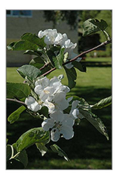
Macintosh Apple flowers