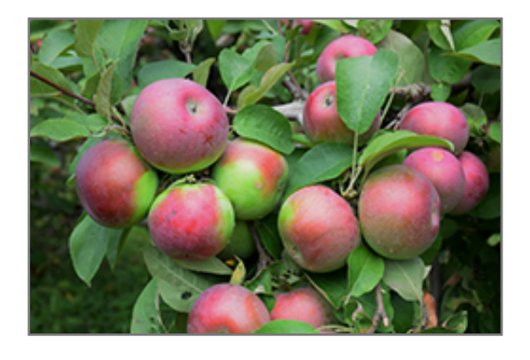
Macintosh Apple fruit

Macintosh Apple features showy clusters of lightly-scented white flowers with shell pink overtones along the branches in mid spring, which emerge from distinctive pink flower buds. It has forest green deciduous foliage. The pointy leaves turn yellow in fall. The fruits are showy red apples with hints of light green, which are carried in abundance in early fall. The fruit can be messy if allowed to drop on the lawn or walkways, and may require occasional clean-up.