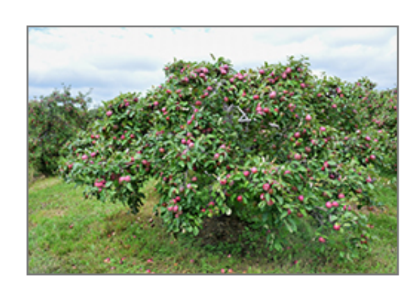
Macintosh Apple fruit

This tree is typically grown in a designated area of the yard because of its mature size and spread. It should only be grown in full sunlight. It prefers to grow in average to moist conditions, and shouldn't be allowed to dry out. It is not particular as to soil type or pH. It is highly tolerant of urban pollution and will even thrive in inner city environments. This particular variety is an interspecific hybrid.