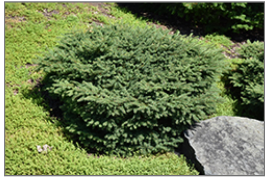
Birds Nest Spruce