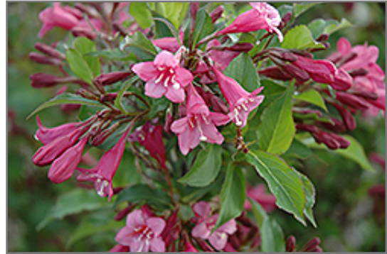
Rumba Weigela flowers