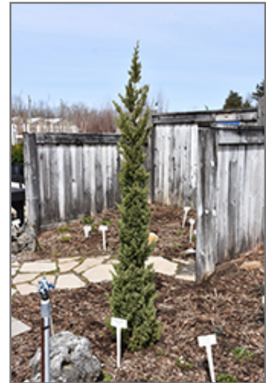
Trautman Juniper

This shrub should only be grown in full sunlight. It is very adaptable to both dry and moist growing conditions, but will not tolerate any standing water. It is not particular as to soil type or pH. It is highly tolerant of urban pollution and will even thrive in inner city environments. This is a selected variety of a species not originally from North America.