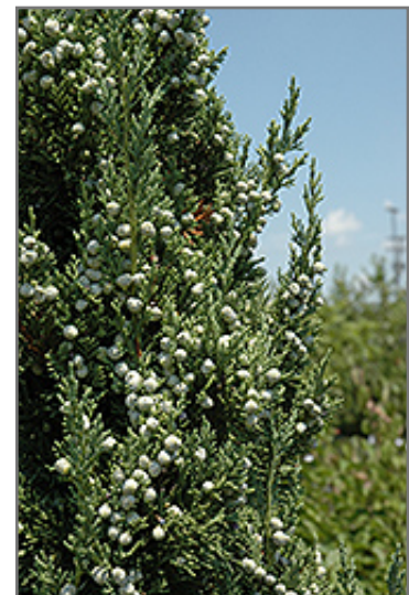
Trautman Juniper fruit