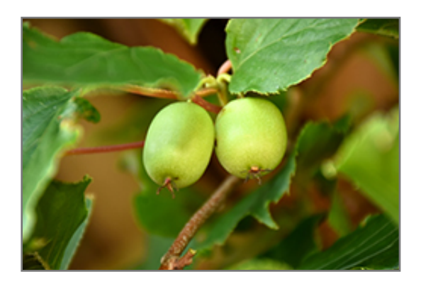
Issai Hardy Kiwi fruit

Aside from its primary use as an edible, Issai Hardy Kiwi is sutiable for the following landscape applications;