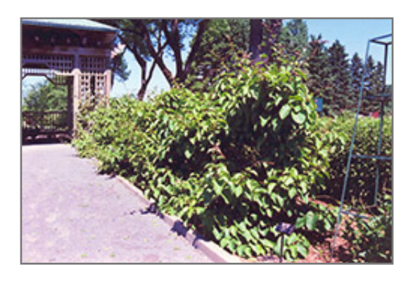
Issai Hardy Kiwi