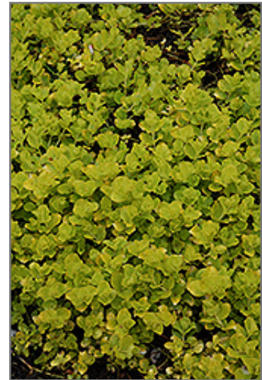
Golden Creeping Jenny foliage

Golden Creeping Jenny is recommended for the following landscape applications;