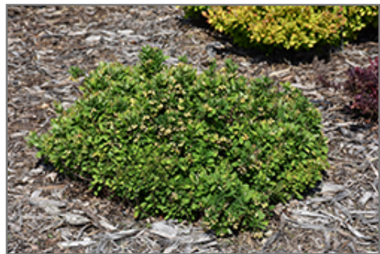
Moscato Barberry