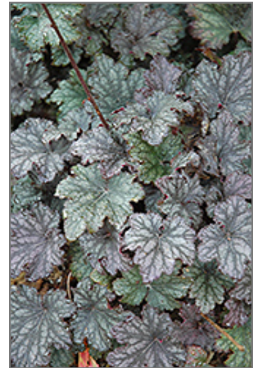
Frosted Violet Coral Bells foliage

This is a relatively low maintenance plant, and should be cut back in late fall in preparation for winter. It is a good choice for attracting hummingbirds to your yard. It has no significant negative characteristics.