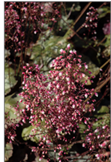
Frosted Violet Coral Bells flowers